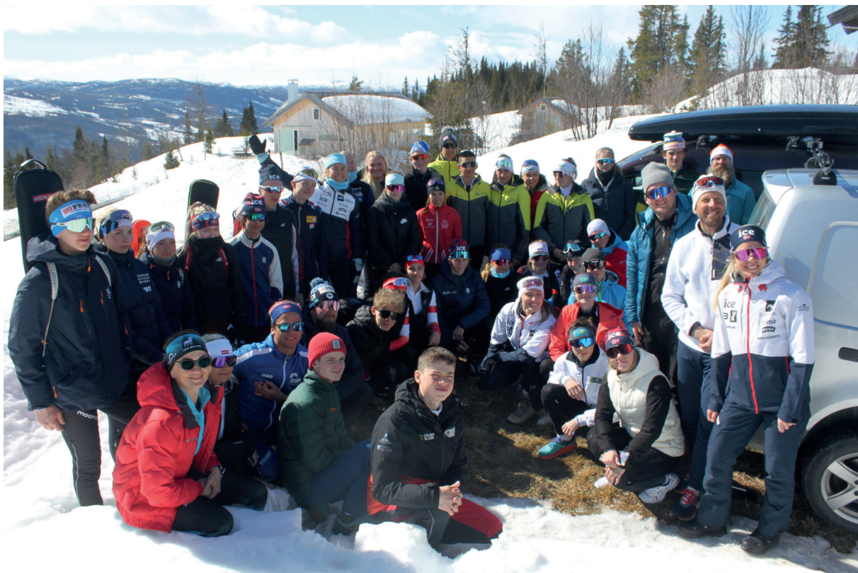
The participants at the Liatoppen Biathlon Festival and development program in April 2024 together with Ingrid Landmark Tandrevold.

It is mandatory to possess both sufficient liability and accident insurance for covering accident, recovery and transport costs, including for Camp-related risks to an adequate extent when participating in any camps, competitions or activities sanctioned or authorized by the IBU.